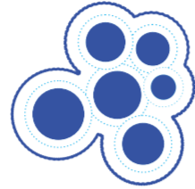
Basic 6 element of society